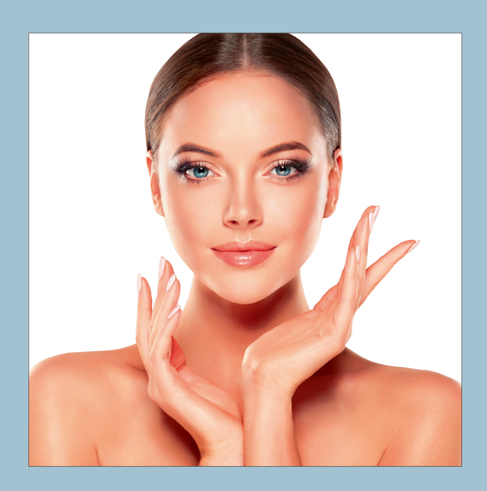
RADIOFREQUENCY Skin rejuvenation through thermal lift!